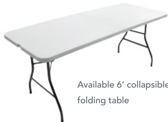
Available 6' collapsible folding table

Secure your table cover with clear, plastic table clips and ensure a secure fit. Recommended at 24" intervals