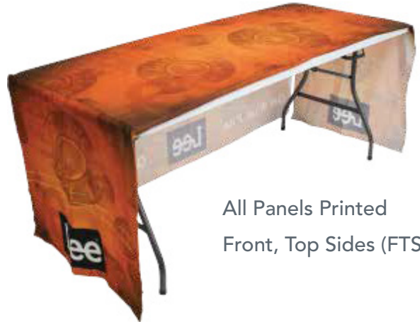
All Panels Printed Front, Top Sides (FTS)